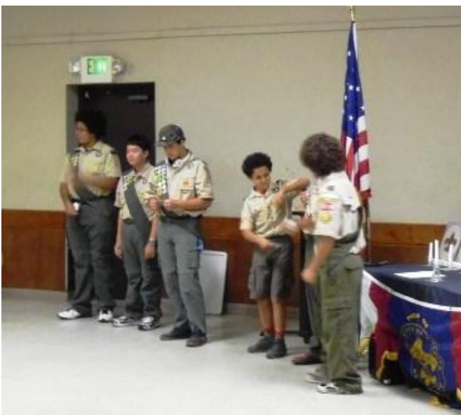
And awarding even more Merit Badges earned this summer.

http://www.rivertoys.com/t314_0914_coh/index.html