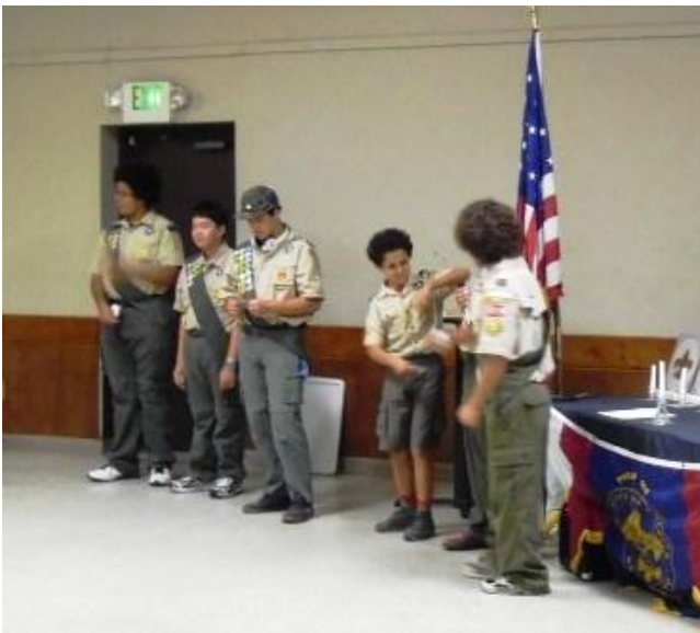
Merit Badges earned.