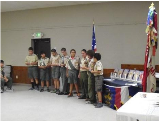
Merit Badge recognition for more Scouts