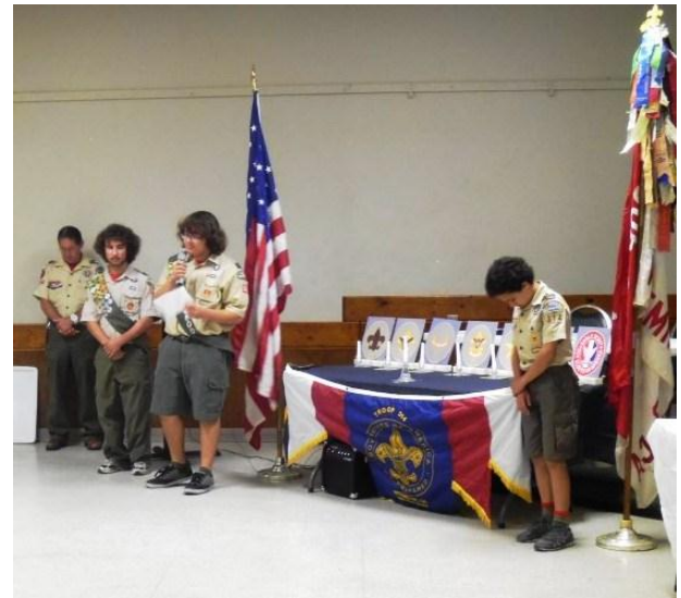
The Invocation is given.