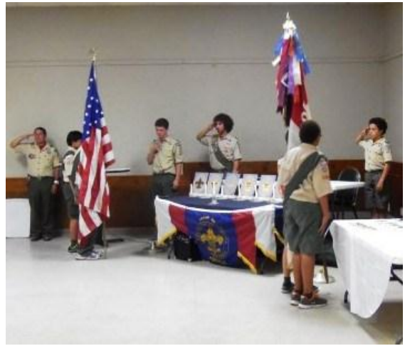
Posting of the Colors.